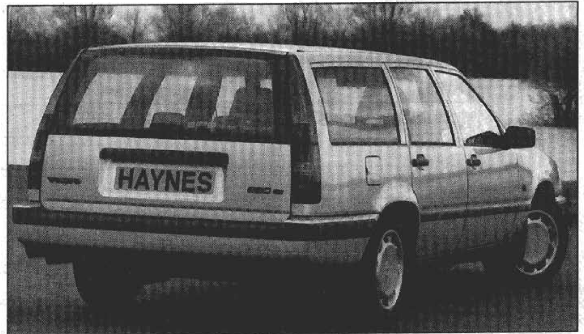
Volvo 850 SE Estate

Provided that regular servicing is carried out in accordance with the manufacturer's recommendations, the Volvo 850 will provide the enviable reliability for which this marque is famous. The engine compartment is relatively spacious and most of the items requiring frequent attention are easily accessible.